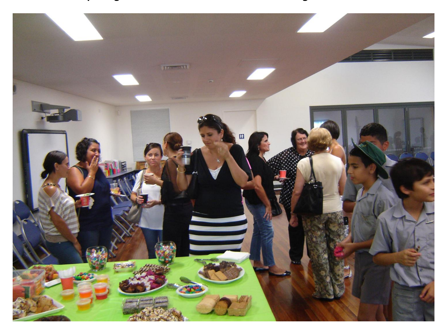
Opening Mass - School Leaders & Morning Tea