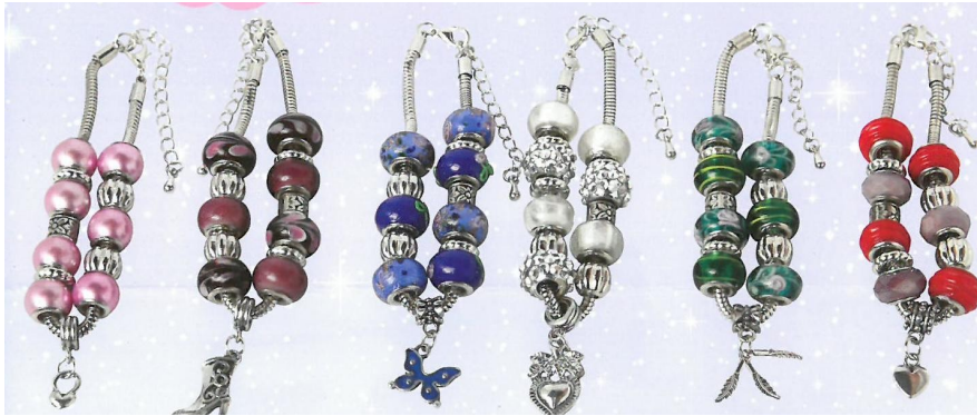
Beaded Bracelet $4.50