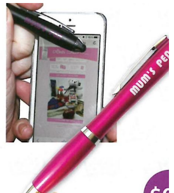
Magnetic Shopping List & Stylus Pen $4.00