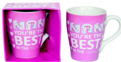
Nan Mug $4.00