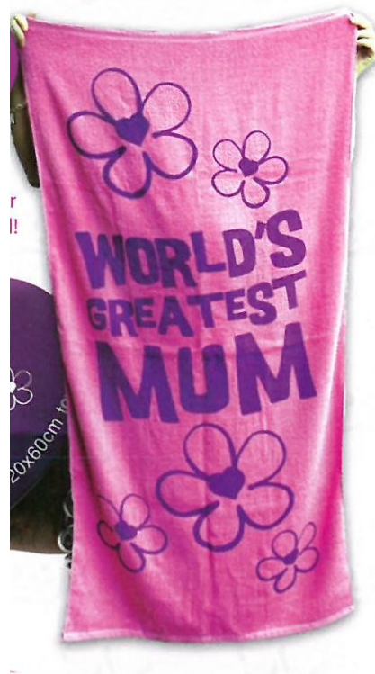
Compressed Towel $5.00