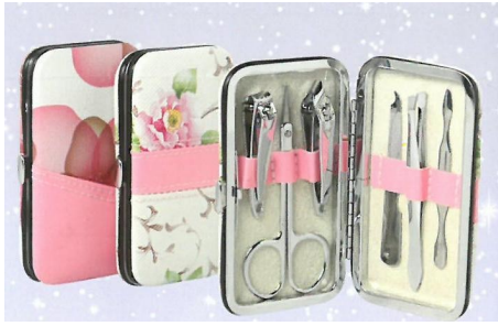
Manicure Set $4.00