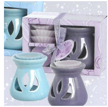
Melt Wax Burner $4.00