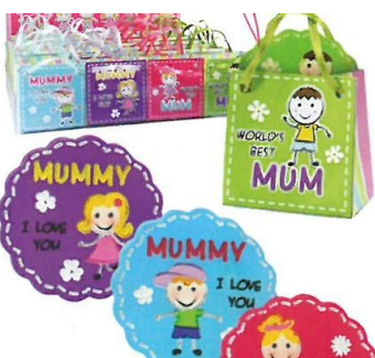
Mini Magnet Bag $3.00