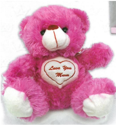
I love You Bear $5.00