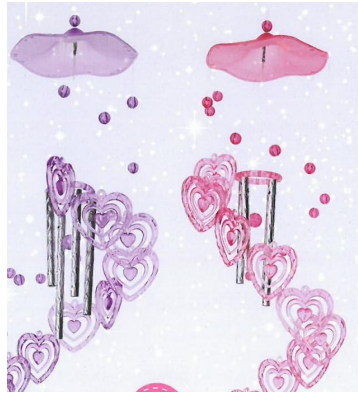
Wind Chime $4.00