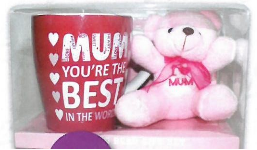
Mum & Bear Gift Pack $5.00