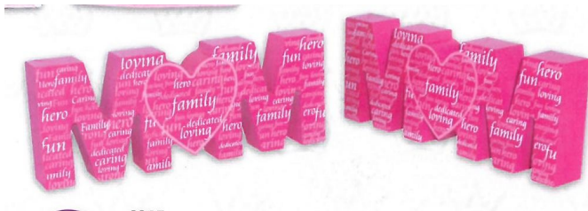
Mum Plaque $4.00