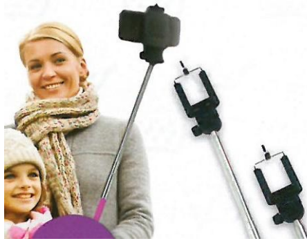
Selfie Stick $5.00