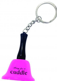
Ring Bell for cuddles $2.50