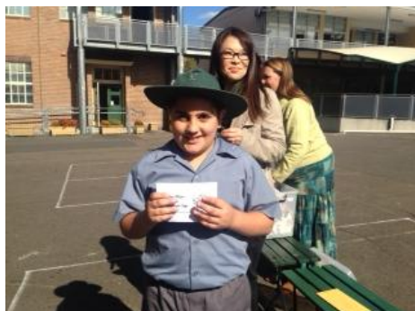
Arthur Constantone Pizza Voucher