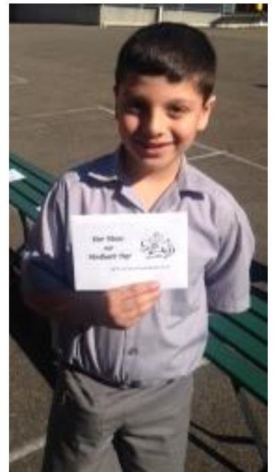
Christian Golossian Pizza Voucher

Thank you to all that purchased tickets. We have raised over $1600 which will go towards valuable resources for our school for Modern big book stands for the classrooms.