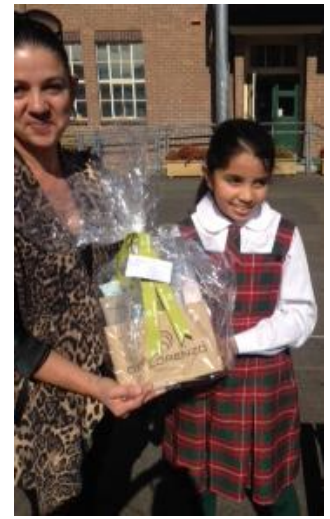
Caitlin Vilches Hair Products