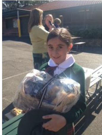
Angel Arida Food Hamper