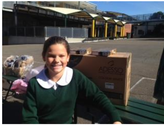
Ashleigh Grubba Coffee Machine