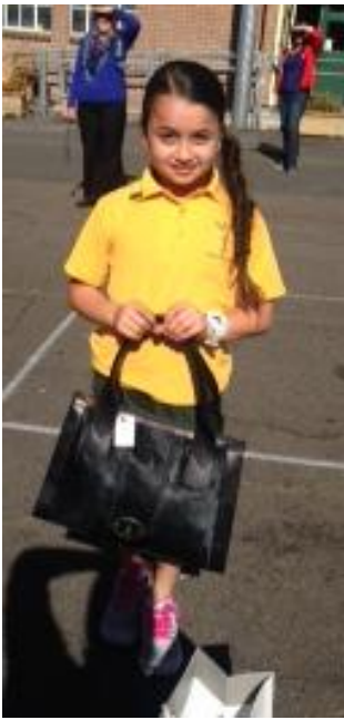
Chanel Nader Handbag