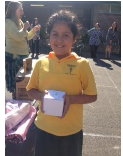
Rosa Itaoui Watch